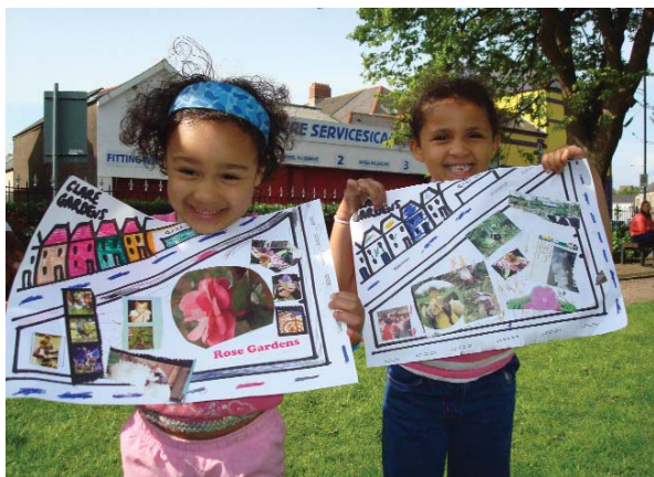
Community garden design workshop, Cardiff

practical you can get an architect's scale rule which has several sides with different scales to make life easier.