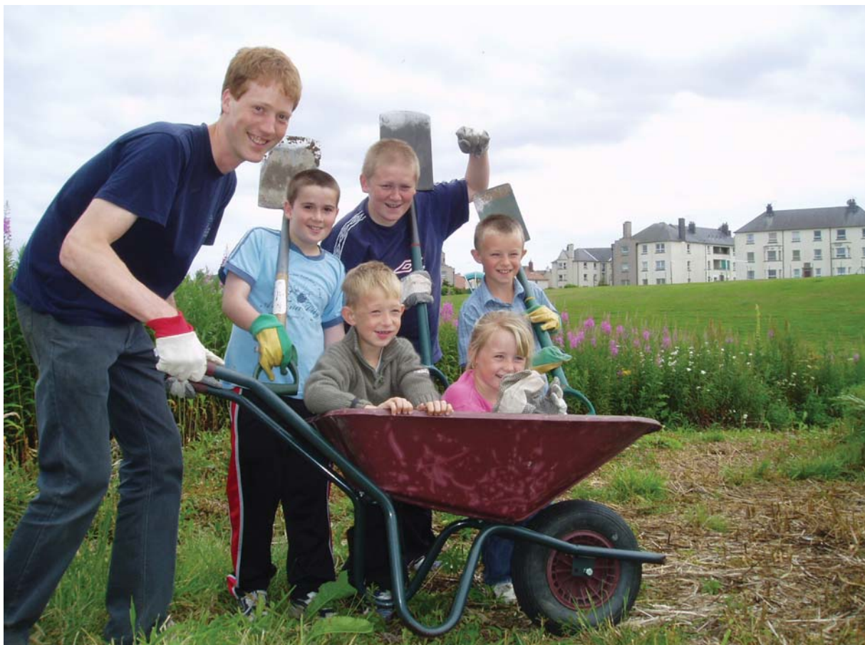
Healthy Roots, Aberdeen