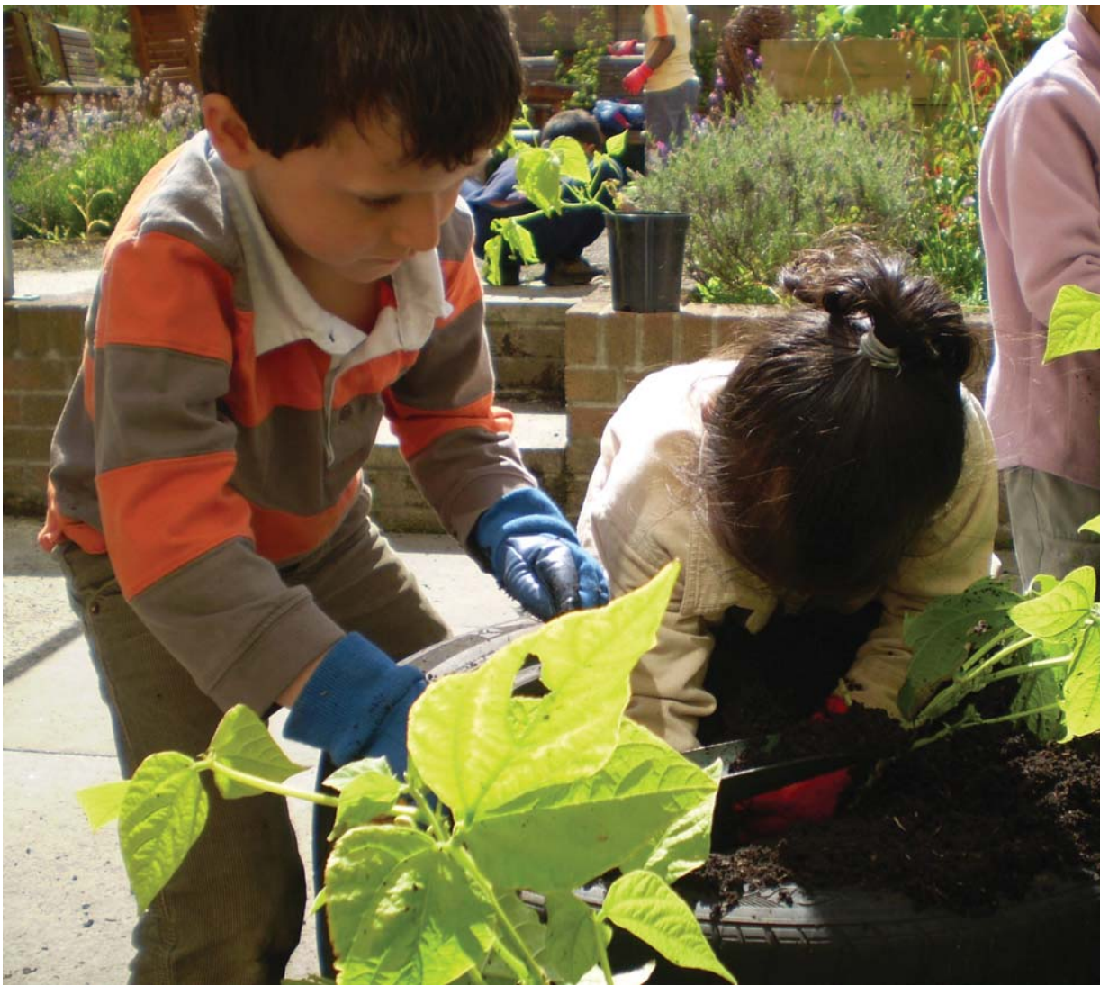
Adamsdown Community Garden, Cardiff

A budget is always an internal document for your own group's use. You will not be held to it by a funder or other outside body.