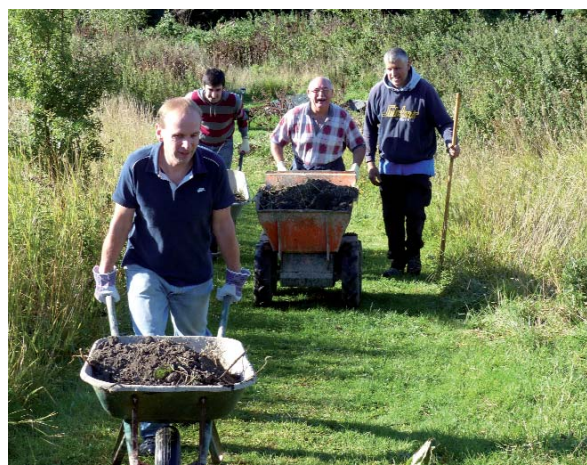
Meanwood Valley Urban Farm, Leeds

See details under Step 10: Governance & paperwork