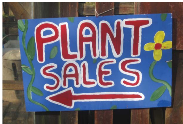
St Werburghs City Farm, Bristol

You will need to put in some organised planning and effort in order to attract donations-in-kind. Ideas include: