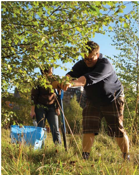
North Kelvin Meadow Campaign, Glasgow

have donated and the positive benefits to the local community that have resulted from their support. The task of reporting to funders will be made much easier if you keep appropriate records of the work, events and activities they have funded.