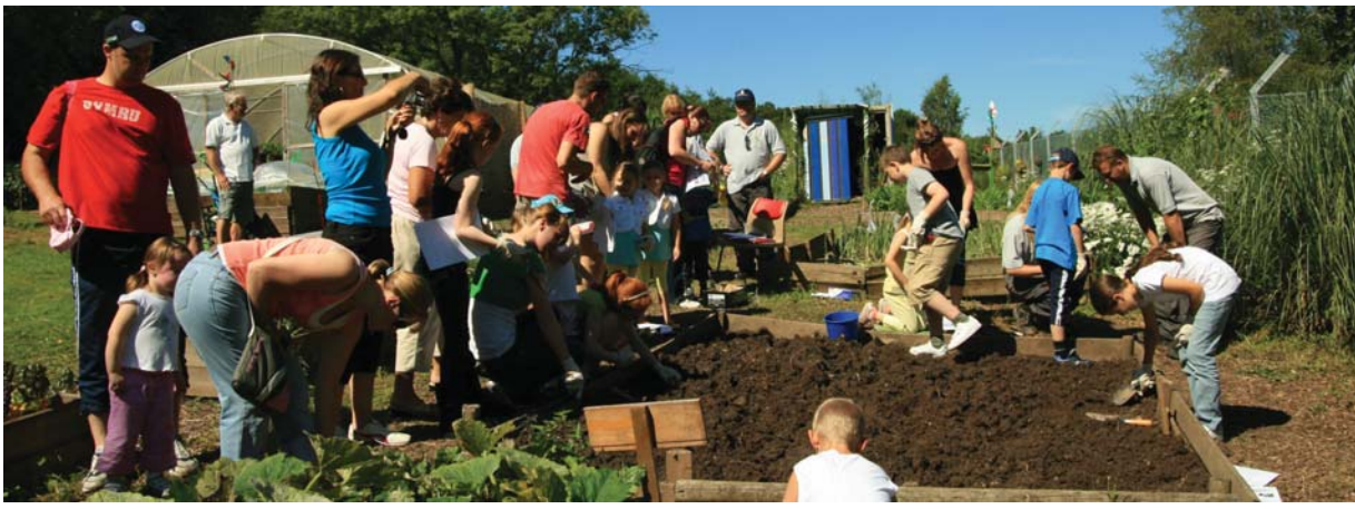
Greenmeadow Community Farm, Cwmbran

previous use may have been. This will be a concern for any project planning to consume, donate or sell produce or keep livestock.