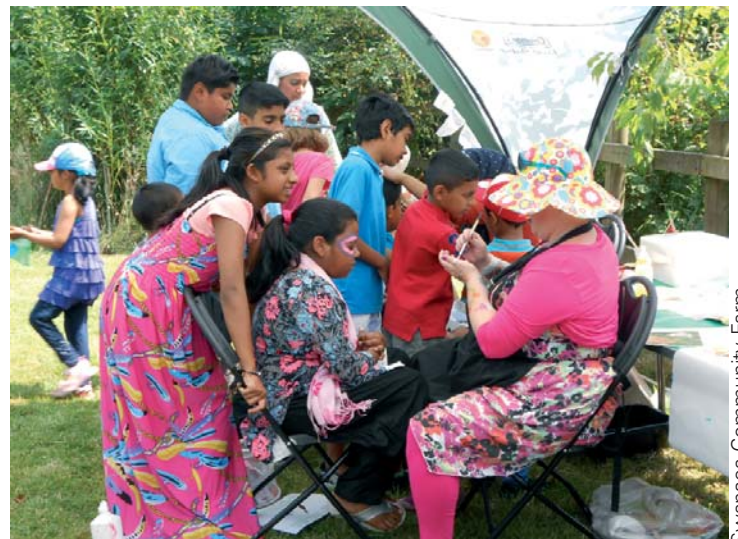
Swansea Community Farm

Appoint someone from your group to take responsibility for publicity - to build contacts with the media, in particular local newspapers, local broadcasters (radio and TV), local magazines and community