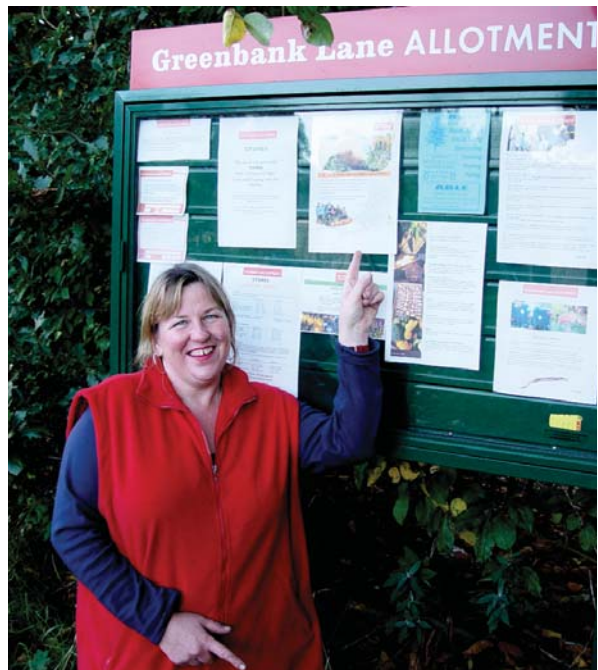
Greenbank Lane Allotments, Liverpool