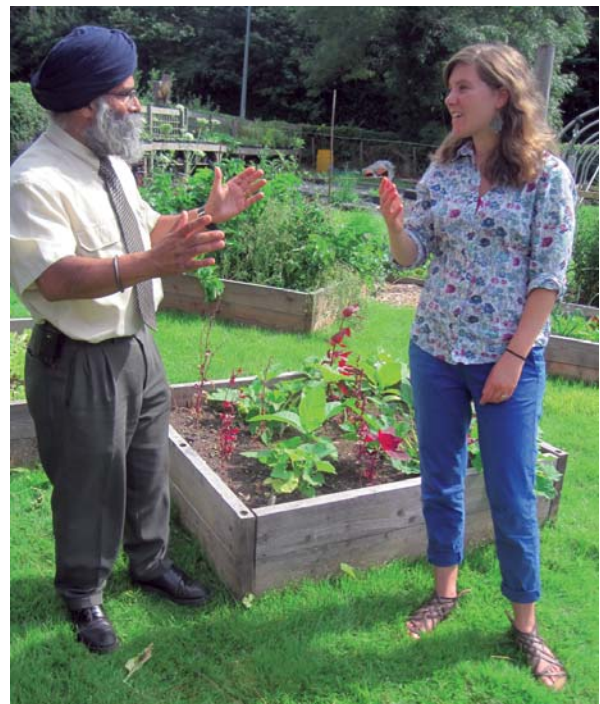
Cwm Harry Food Company