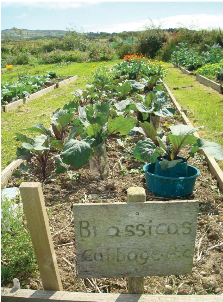
Felin Uchaf, Pwllheli

skills, knowledge and experience you haven't yet discovered! It's important, therefore to remember to ask the members of your group if any of them are able to provide the advice you need before seeking external advisers - you need to tap the great variety of local knowledge, skills and expertise that exist in every area, including yours!