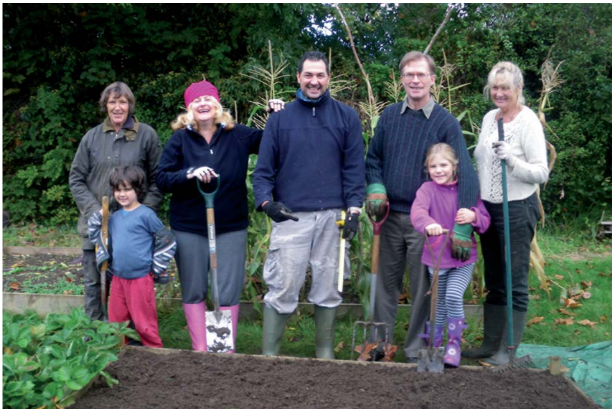
Alice Park Community Garden, Bath

The steering group should be clear about what it wants and what it can offer before you arrange to meet any outside person or organisation. At the meetings avoid confrontation and conflict. Make a considered presentation of your ideas for the community garden.