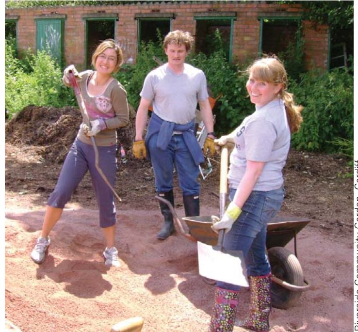
Riverside Community Garden, Cardiff

Remember: active members are your garden's most valuable resource. You will know from your records how to contact them and ask for help. Some of them will be future management committee members.