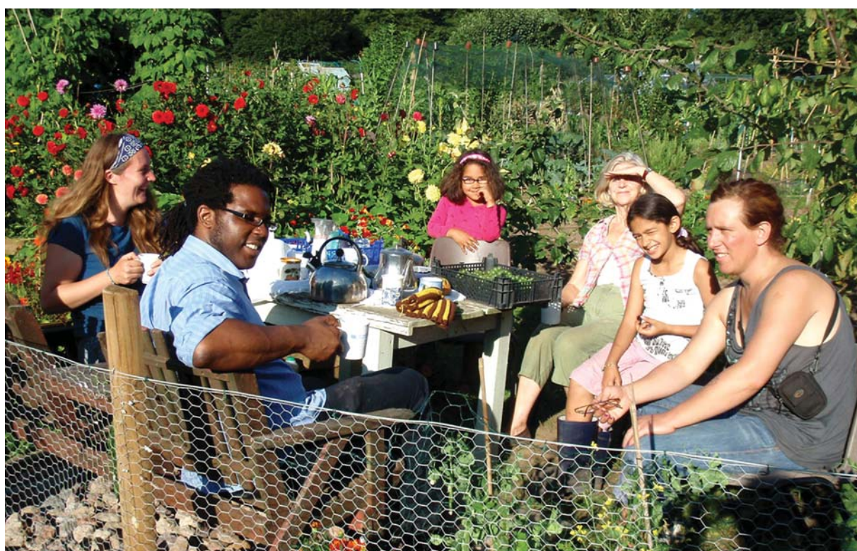
Riverside Community Garden Allotment Project, Cardiff