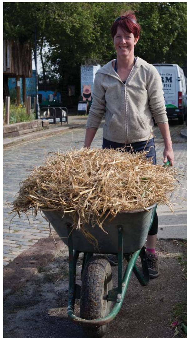
Spitalfields City Farm, London

person. Whether a professional audit is required depends on the type of organisation and the level of its annual turnover. If your organisation is a charity with £50,000 turnover or more we strongly recommend that you have a professional audit, although this is not a legal requirement.