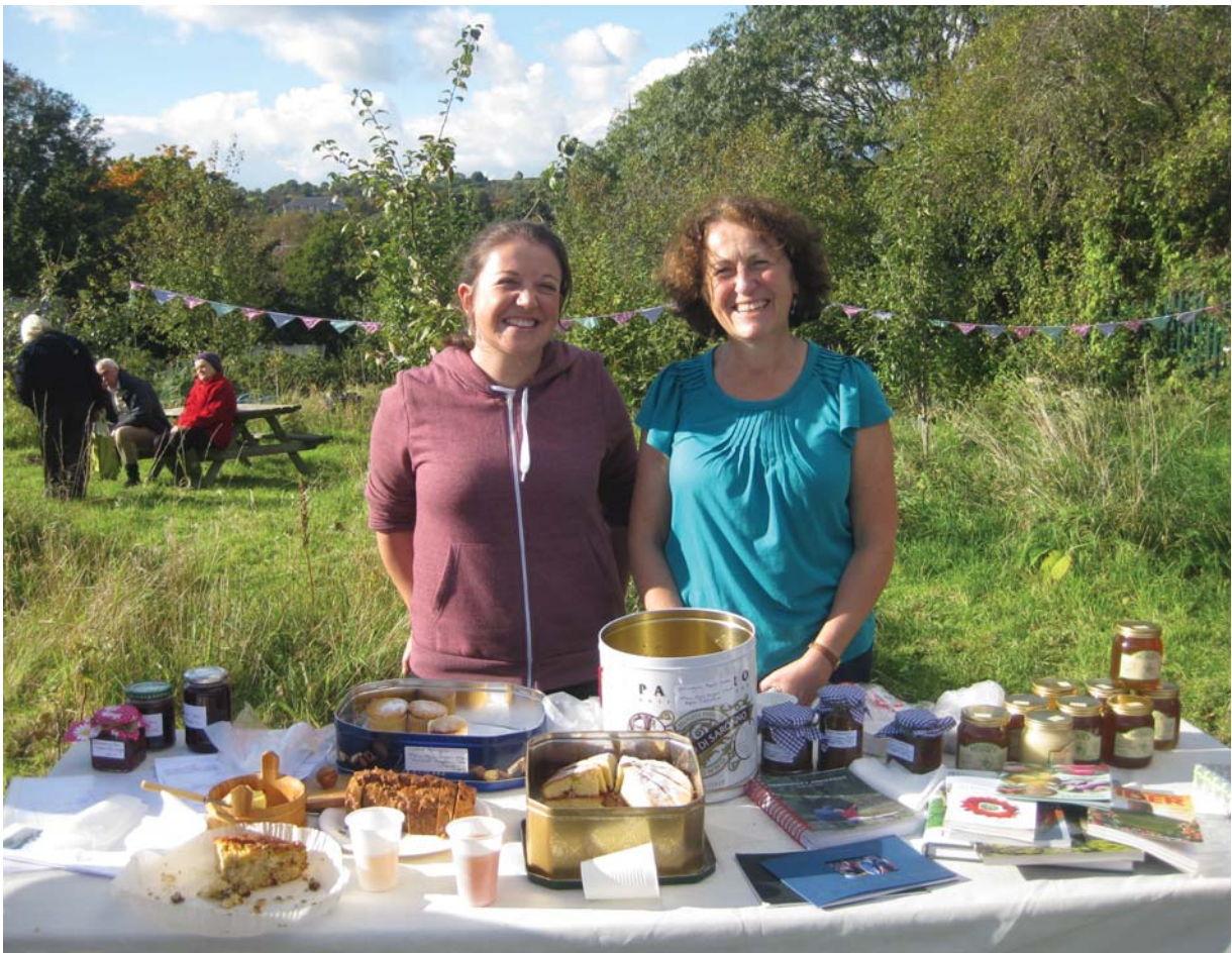
Fishponds Community Orchard, Bristol

The public meeting can be used in conjunction with the other consultation methods outlined below. Make sure representatives from local stakeholder groups and local councillors are all invited. This meeting could then be followed up by subsequent meetings as your group comes together or if there are important issues to discuss.