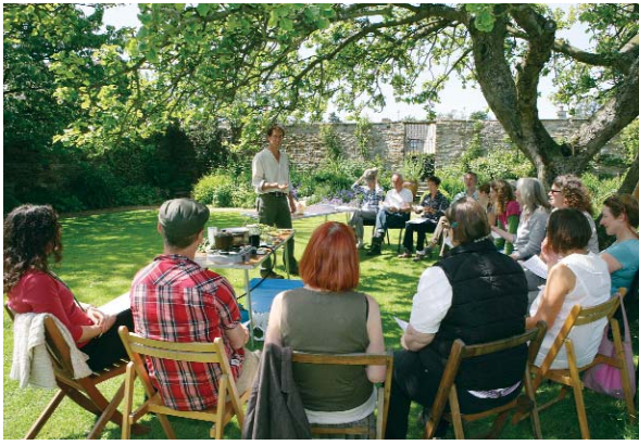
Reeth Community Orchard, Yorkshire

Your plan should include a statement about where you are now and where you aim to be in two or three years' time. The plan should be clear, concise, honest and accurate (e.g. ensure all your figures tally up across the document – if they don't it will lose credibility). Remember, the plan should be a working document that you can use on a regular basis, not something you put together then file away.