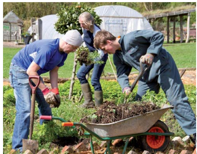
The Ecology Centre, Fife

There's no getting round the fact that employing people can be complex, adds to the administration of an organisation and requires a lot of good practice. However, by treating your workers well you can reap many rewards from a committed and enthusiastic staff member. Remember that all employees will have employment rights, such as entitlement to contracts, periods of notice, redundancy payments, claims for unfair dismissal, holidays, maternity and paternity leave etc.