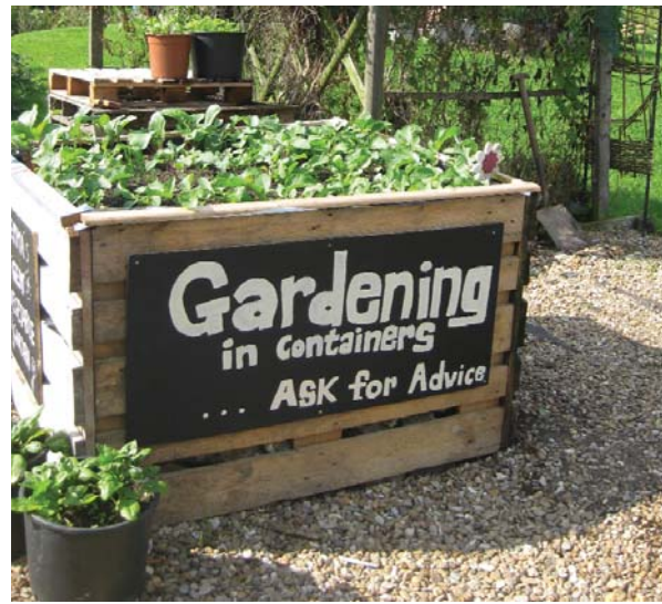
Stonebridge City Farm, Nottingham

The table on page 21 provides a summary of the key features of the most common