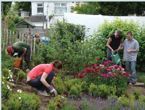
Fairwater Community Garden, Cardiff