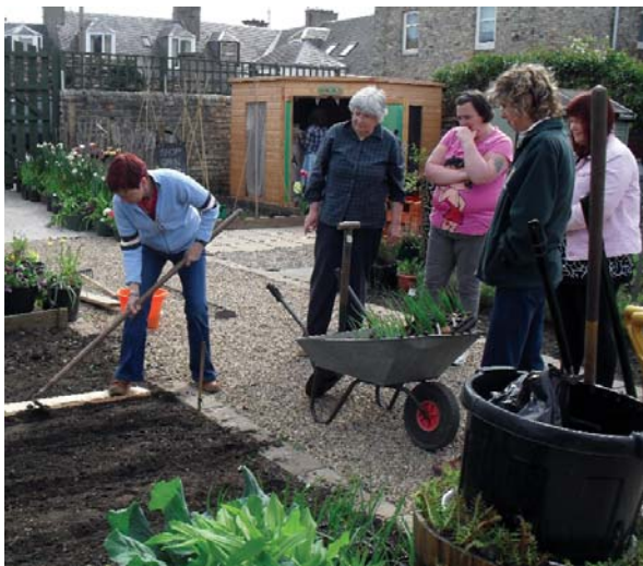
Girvan Community Garden, Scotland

This is the most common form of charity and is often chosen by larger organisations - those that manage large sums of money,