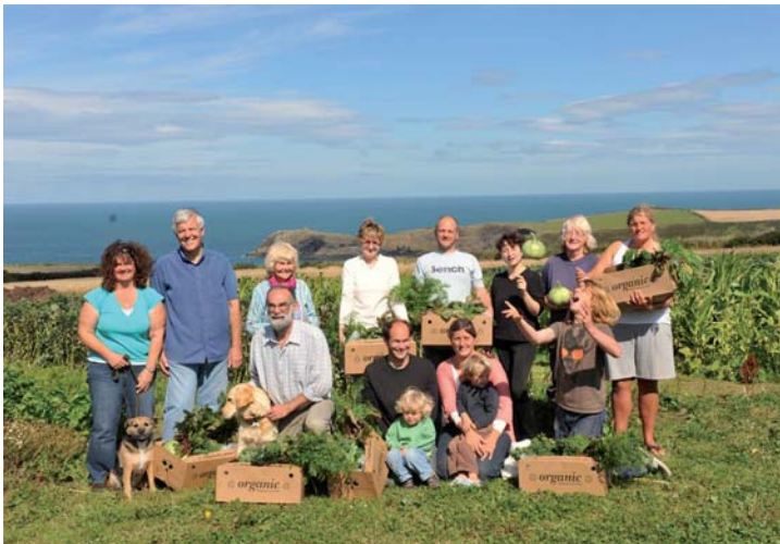
Caerhys Organic Community Agriculture, St Davids

There may be some brownfield, underused, waste ground or derelict sites available in urban areas. These landowners may welcome an income and participation on their land by the community if they do not have any immediate plans for the site or while the site is awaiting redevelopment (see Development Land below). However, bear in mind that derelict land - especially brownfield sites - could be contaminated and therefore the land may not be appropriate for food growing or it may cost a considerable amount to clear the contaminants.