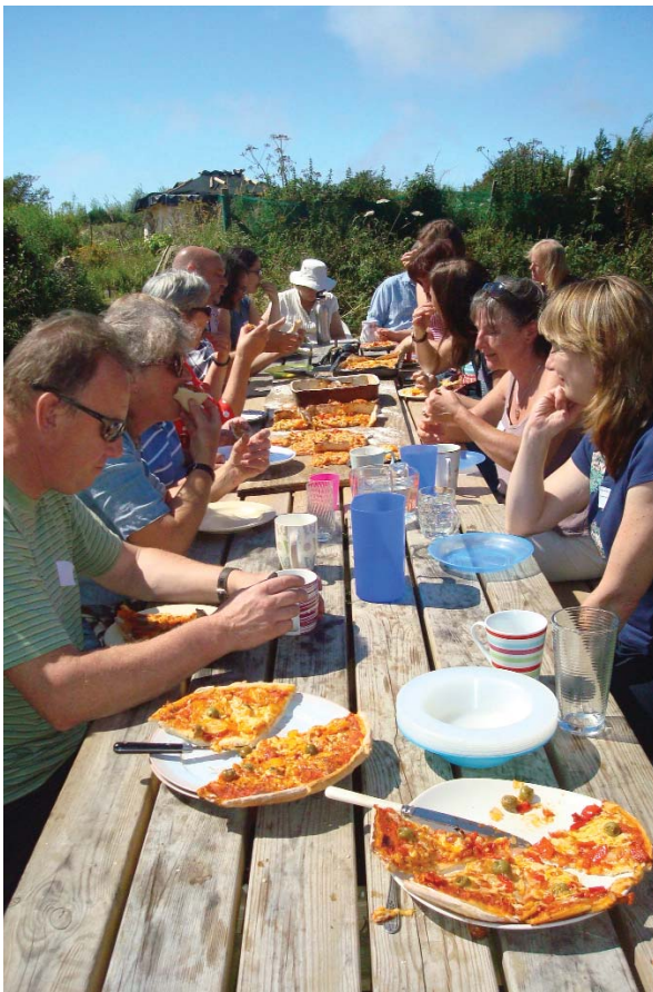
Felin Uchat, Pwllheli

others are doing, share problems and learn new skills.