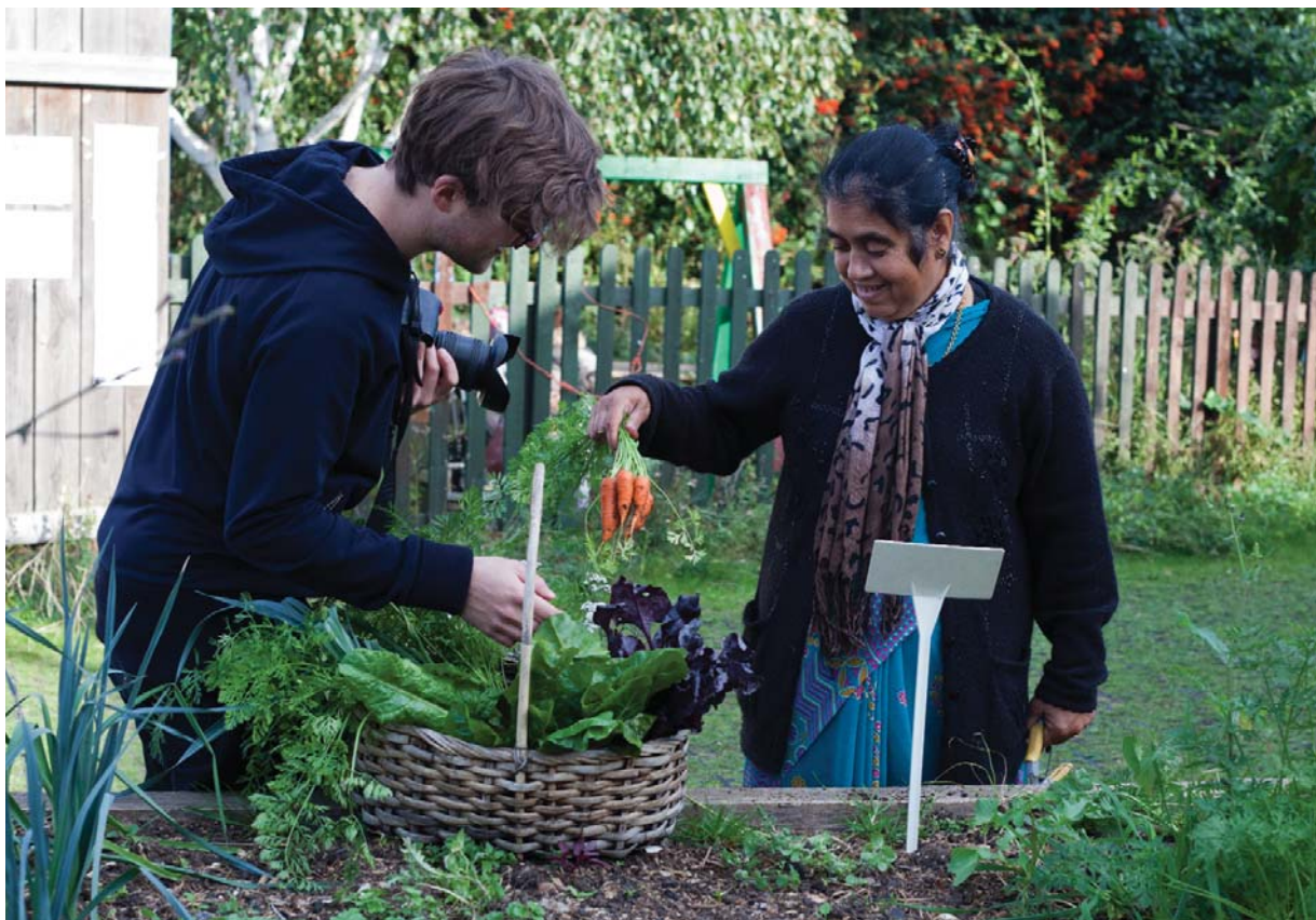
Spitalfields City Farm, London