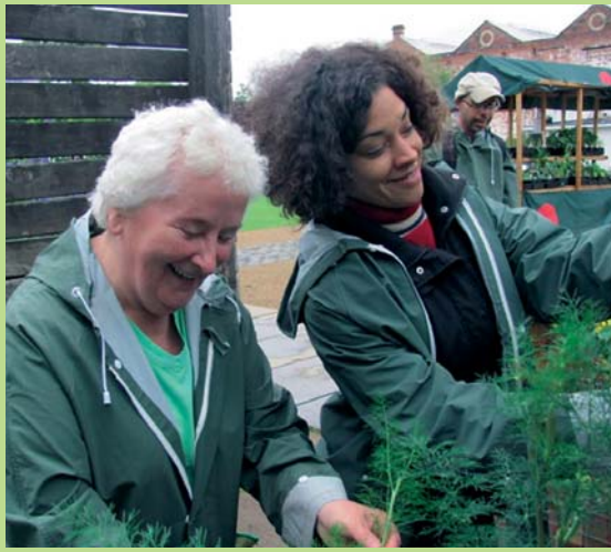
The Hidden Gardens, Glasgow