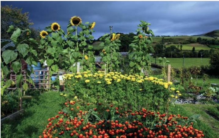
Knucklas Castle Community Land Project

Most existing community growing spaces do not own the land they use; some are on licence but most are leased. The majority pay a peppercorn rent, i.e. a nominal sum.