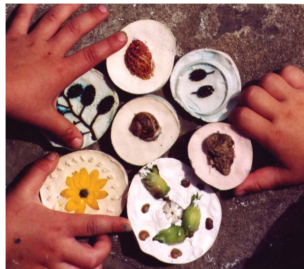
Culpeper Community Garden, London

Legal structures for community organisations fall into one of two broad categories: unincorporated and incorporated. It is vital to understand the differences between these two and their legal implications, particularly in relation to the potential personal liability of committee members.