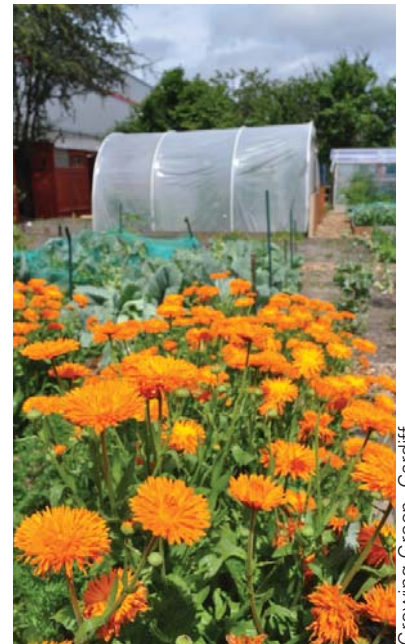
Growing Green, Cardiff

To get a copy of the tool, visit the FCFCG website at: www.farmgarden.org.uk/wales