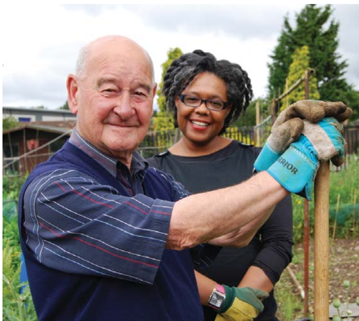
Walsall Road Allotments, Birmingham

turnover of more than £77,000 (at April 2012) a year, must register for Value Added Tax (VAT) and keep detailed records. This figure is usually changed annually.