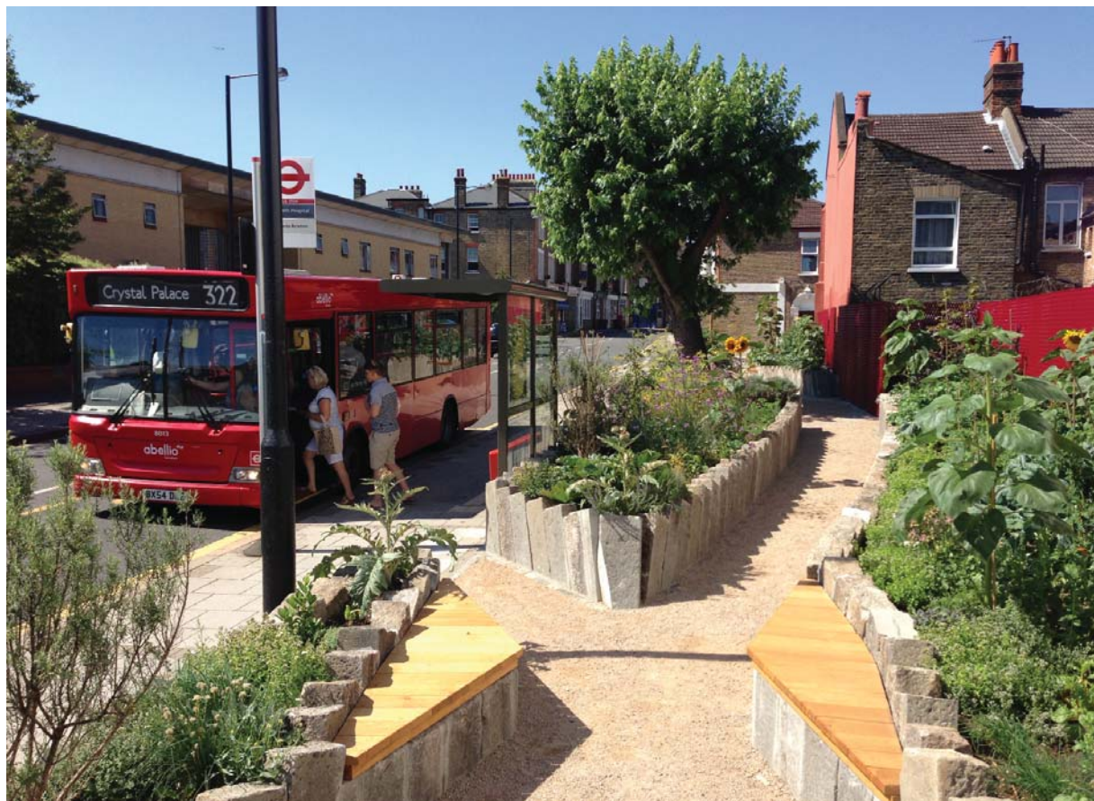
The Edible Bus Stop, London

your group live. Neighbourhoods Green has toolkits available to help get a project off the ground in these circumstances: www.neighbourhoodsgreen.org.uk