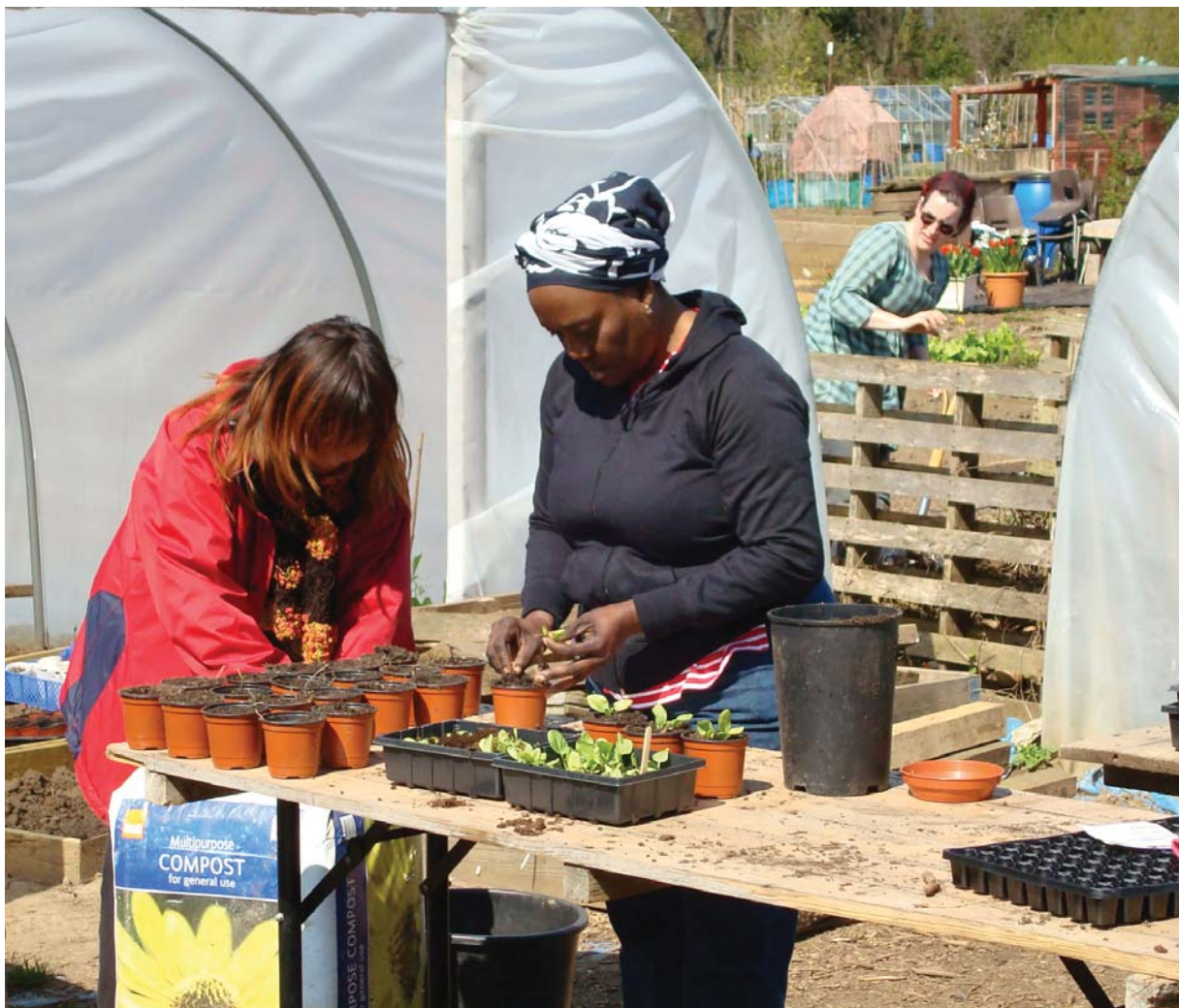
Riverside Community Garden Allotment Project, Cardiff

http://uk.virginmoneygiving.com These can be used by people raising money on behalf of your group, e.g. through a sponsored run. However there may be charges for organisations to use other services associated with these sites.